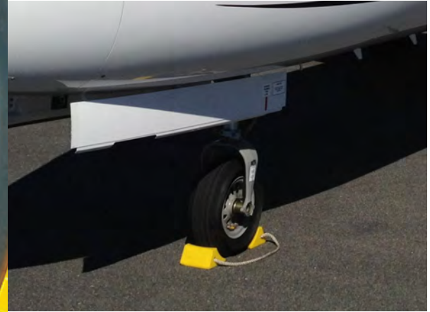
PICTURED: AC3512 IN USE (LEFT) AC201 IN USE (TOP)

Checkers™ Wheel Chocks comply with the safety requirements of a variety of industries and ensure a safe working environment while your vehicles are at rest. Offered in a variety of styles, our wheel chocks provide a safe chocking solution for any type of vehicle.