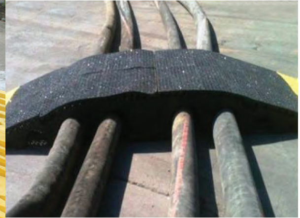
PICTURED: CHHBS IN USE (LEFT) CHWSHBS IN USE (TOP)

Checkers™ Cable Management offers the most extensive line of high performance cable/hose protection products in the world. These durable cable protection systems provide a safer method of passage for pedestrian traffic, vehicles and heavy duty equipment while protecting valuable electrical cables, cords and hose lines from damage.