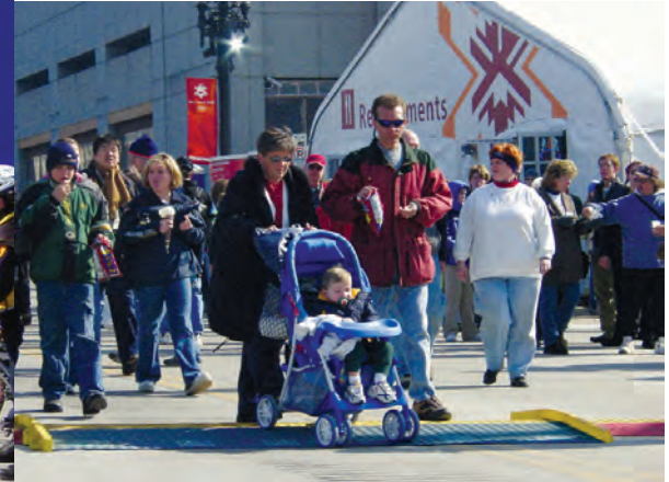
PICTURED: CPRP AND CPRL IN USE

Checkers™ Cable Management offers the most extensive line of high performance cable/hose protection products in the world. These durable cable protection systems provide a safer method of passage for pedestrian traffic, vehicles and heavy duty equipment while protecting valuable electrical cables, cords and hose lines from damage.