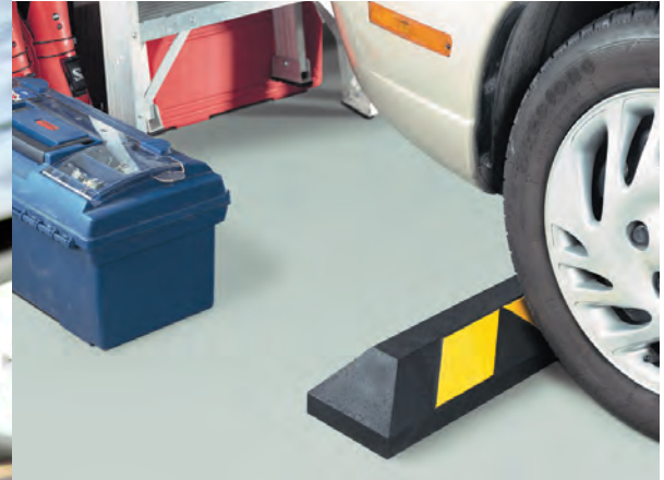
PICTURED: PARK-IT CAR STOP

Checkers™ Motion Safety is a full service manufacturer of parking lot safety solutions. We design and manufacture traffic control products that help cars navigate and park safely. Our main goal has been to create solutions that protect motorists and pedestrians from the perils of today's parking lots. As such, Monster's products have been designed and developed with speed reduction, driver and pedestrian safety in mind. All of our solutions are manufactured from 100% recycled rubber and plastic. Rubber and plastic speed bumps or parking blocks, for example, are longer lasting, highly visible, and more car-friendly than asphalt or concrete alternatives. Not only are Monster's traffic safety solutions environmentally friendly, they can also be installed for both temporary or permanent use.