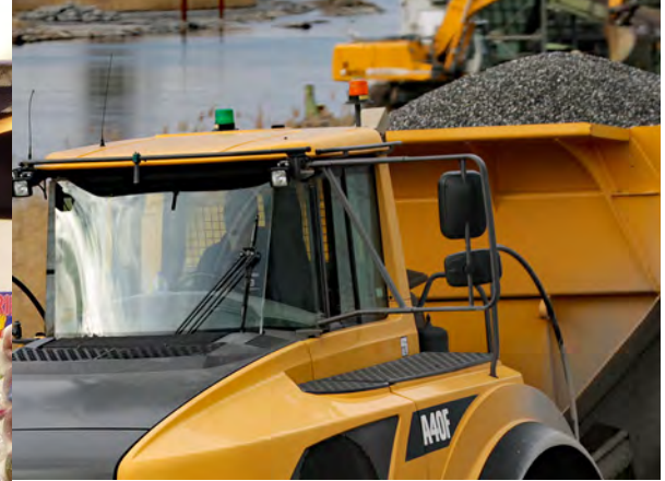
PICTURED: BEACON IN USE

⚠ WARNING: This product can expose you to chemicals including Isopropylidenediphenol, Methylene Chloride, Ethanol, Ethylbenzene, Hexane, Lead, Methanol, Nickel Compounds, and Naphthalene, which are known to the State of California to cause cancer and birth defects or other reproductive harm. For more information go to www.P65Warnings.ca.gov .