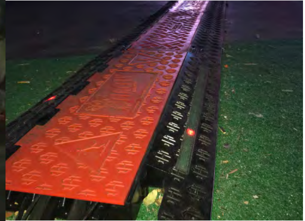
PICTURED: FF5X125 IN USE

Checkers™ Cable Management offers the most extensive line of high performance cable/hose protection products in the world. These durable cable protection systems provide a safer method of passage for pedestrian traffic, vehicles and heavy duty equipment while protecting valuable electrical cables, cords and hose lines from damage.