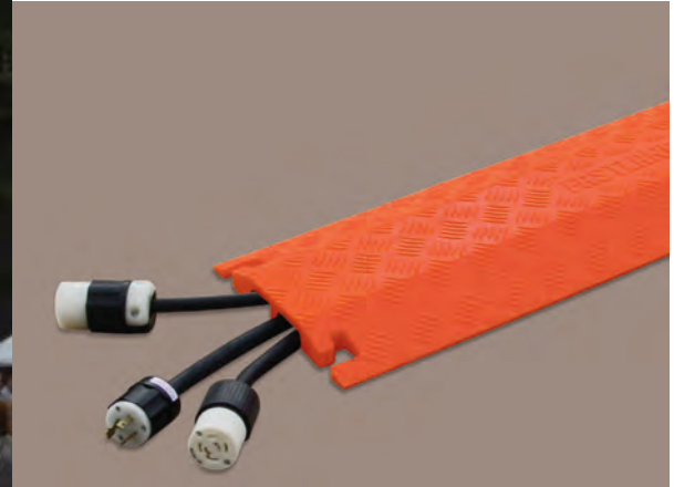
PICTURED: FL2X1.75 IN USE

Checkers™ Cable Management offers the most extensive line of high performance cable/hose protection products in the world. These durable cable protection systems provide a safer method of passage for pedestrian traffic, vehicles and heavy duty equipment while protecting valuable electrical cables, cords and hose lines from damage.