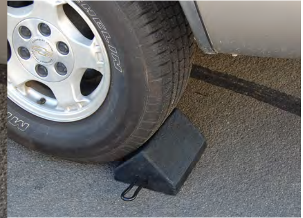
PICTURED: RC450 IN USE

Checkers™ Wheel Chocks comply with the safety requirements of a variety of industries and ensure a safe working environment while your vehicles are at rest. Offered in a variety of styles, our wheel chocks provide a safe chocking solution for any type of vehicle.