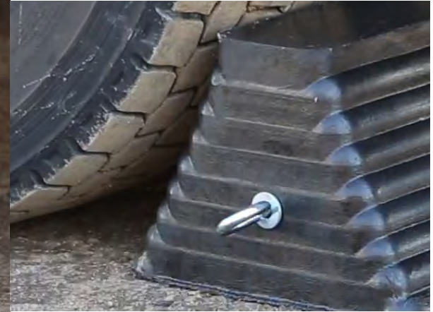
PICTURED: RC915 IN-USE

Checkers™ Wheel Chocks comply with the safety requirements of a variety of industries and ensure a safe working environment while your vehicles are at rest. Offered in a variety of styles, our wheel chocks provide a safe chocking solution for any type of vehicle.