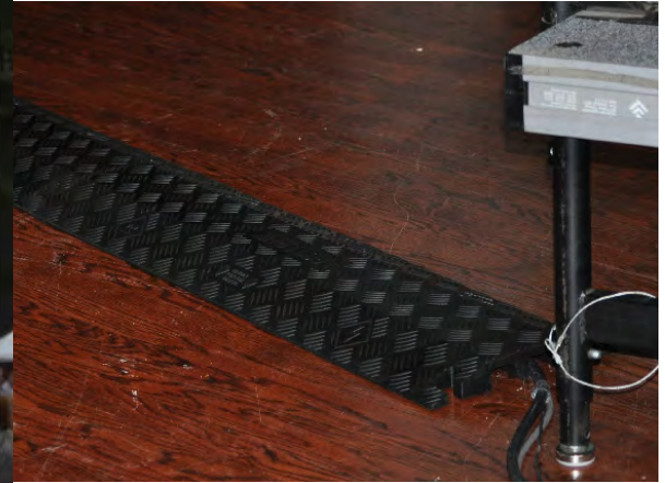
PICTURED: FL2X1.75 IN USE

Checkers™ Cable Management offers the most extensive line of high performance cable/hose protection products in the world. These durable cable protection systems provide a safer method of passage for pedestrian traffic, vehicles and heavy duty equipment while protecting valuable electrical cables, cords and hose lines from damage.