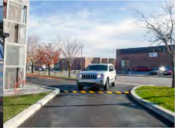
PICTURED: SPEED BUMP

Checkers™ Motion Safety is a full service manufacturer of parking lot safety solutions. We design and manufacture traffic control products that help cars navigate and park safely. Our main goal has been to create solutions that protect motorists and pedestrians from the perils of today's parking lots. As such, Monster's products have been designed and developed with speed reduction, driver and pedestrian safety in mind. All of our solutions are manufactured from 100% recycled rubber and plastic. Rubber and plastic speed bumps or parking blocks, for example, are longer lasting, highly visible, and more car-friendly than asphalt or concrete alternatives. Not only are Monster's traffic safety solutions environmentally friendly, they can also be installed for both temporary or permanent use.