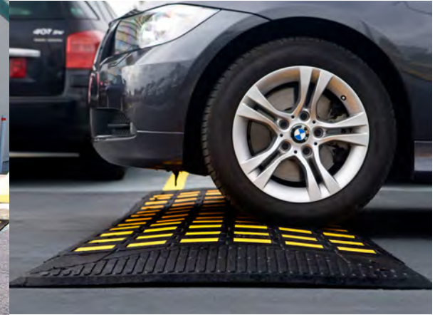
PICTURED: SAFETY RIDER SPEED HUMPS

⚠ WARNING: This product can expose you to chemicals including Arsenic, Cobalt, Cadmium, Lead, Chromium, Nickel Compounds, which is known to the State of California to cause cancer and birth defects or other reproductive harm. For more information go to www.P65Warnings.ca.gov .