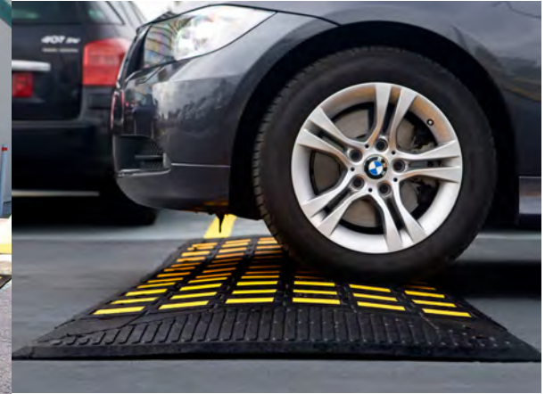
PICTURED: SAFETY RIDER SPEED HUMP

⚠ WARNING: This product can expose you to chemicals including Arsenic, Cobalt, Cadmium, Lead, Chromium, Nickel Compounds, which is known to the State of California to cause cancer and birth defects or other reproductive harm. For more information go to www.P65Warnings.ca.gov .