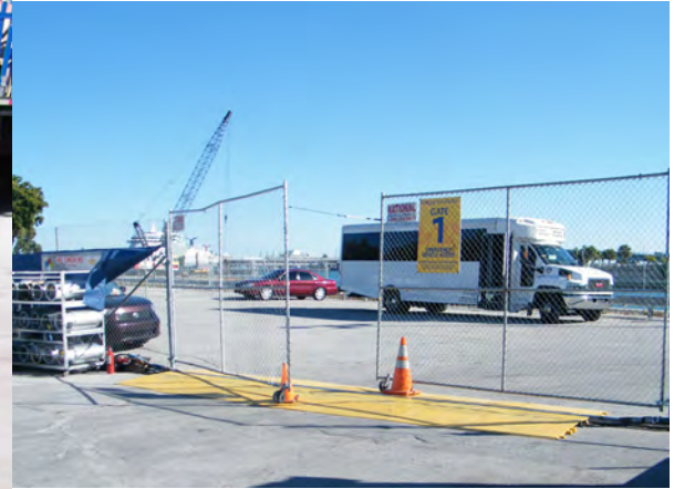
PICTURED: WSA-125-KIT3-HS IN USE

Checkers™ Cable Management offers the most extensive line of high performance cable/hose protection products in the world. These durable cable protection systems provide a safer method of passage for pedestrian traffic, vehicles and heavy duty equipment while protecting valuable electrical cables, cords and hose lines from damage.